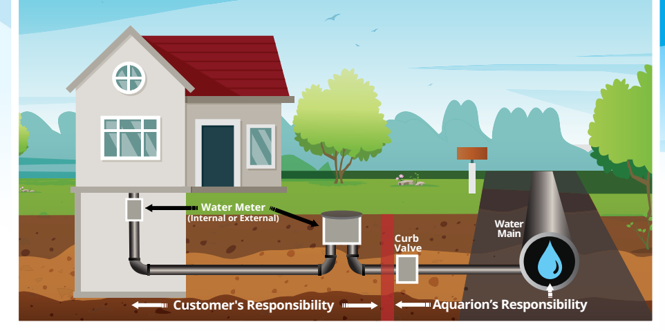
Customer and Aquarion responsibilities shown are representative for most customers.

A service line is the pipe that connects a customer's premises to Aquarion's water main in the street (see diagram on page). Homes built before 1986 may have lead service lines (with a few exceptions, most were installed in homes built before 1930), and those built before 1986 may have lead solder and brass fittings (which may have a lead content).