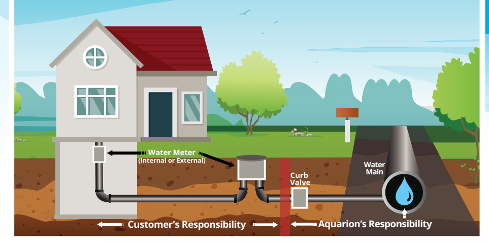
Customer and Aquarion responsibilities shown are representative for most customers.

A service line is the pipe that connects a customer's premises to Aquarion's water main in the street (see diagram on page). Homes built before 1986 may have lead service lines (with a few exceptions, most were installed in homes built before 1930), and those built before 1986 may have lead solder and brass fittings (which may have a lead content).