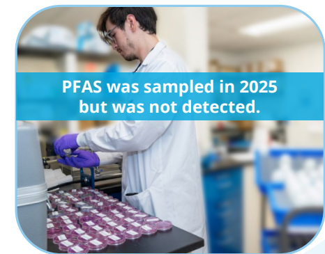
PFAS was sampled in 2025 but was not detected.

Sodium: Sodium-sensitive individuals such as those experiencing hypertension, kidney failure, or congestive heart failure, who drink water containing sodium should be aware of levels where exposures are being carefully controlled.